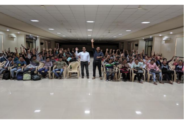
Activity - 1