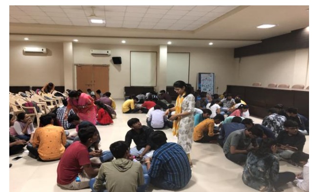
Activity - 2