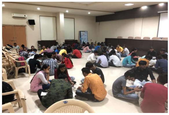
Activity - 2