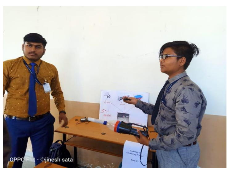
"Student Marketing their product"