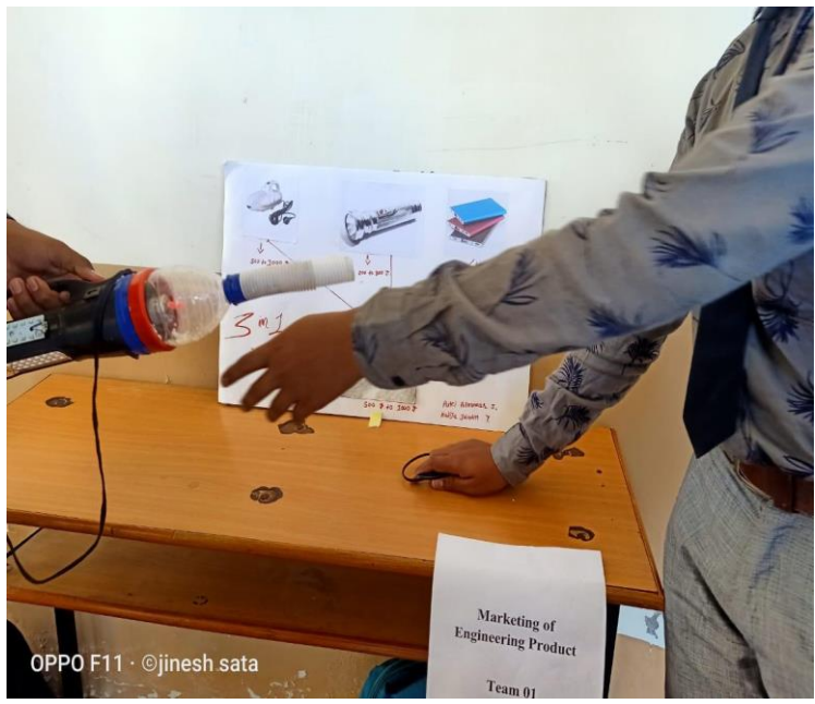
" Student explain their product"