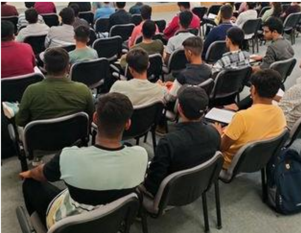
" Attending Session"