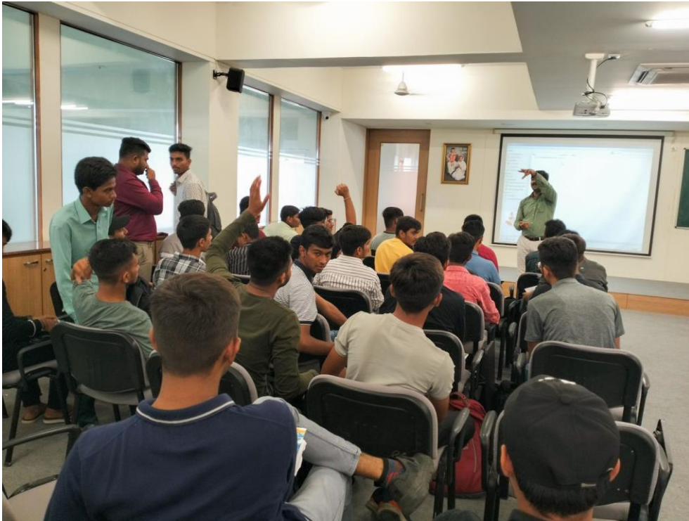
"Question & Answer"