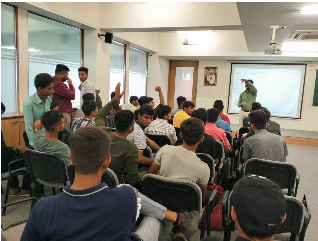
"Attensing Session and Problem Solving"

S.P.B. Patel Engineering College Linch D.H.S.