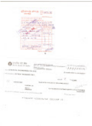
Scan Cheque Copy & Deposit Slip.jpg 1165K

p: +91 22 2407 1055/ 2409 2087 a: 110 Nirmal Indst Estate, Behind Sion Fort, Sion East, Mumbai 400 022 w: www.pulsecho.com e: sales@pulsecho.com