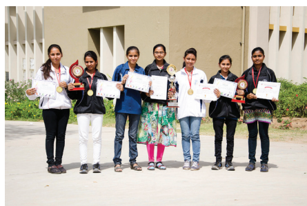
Sports Achievements at National and State Level (in Volley-Ball, Kabbadi, Kho-Kho, Badminton, Chess, Carrom, and Power Lifting)