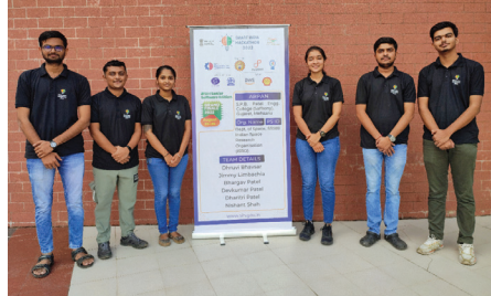
2 nd Rank in India (ISRO Hackathon-2022, Tech: Deep Learning)