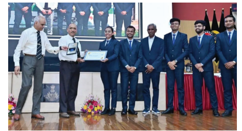
2 nd Rank in India (NSG Hackathon, Tech: Drone & Artificial Intelligence)