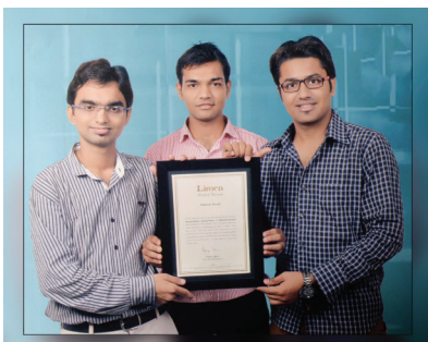
Limca Book of Record (in India's Biggest Rube Goldberg Machine for Chain Reaction)