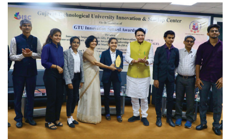
i2i (Innovation to Impact) (i2i Award by GTU, out of 85 teams, Tech: Machine Learning)