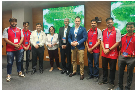
10 th Rank in India (in Dassault, Aakruti National-level competition)