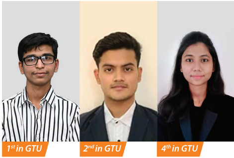
1 st in GTU