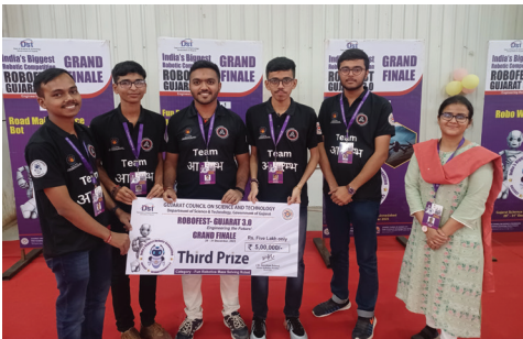
3 rd Rank in India (in GUJCOST RoboFest 3.0)