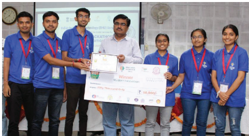
1 st in India, SIH-2022 (Smart India Hackathon-2022 Tech: Artificial Intelligence)